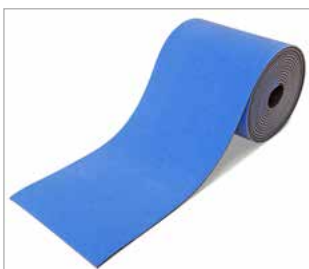
• Art. No. 23005 Run-up track