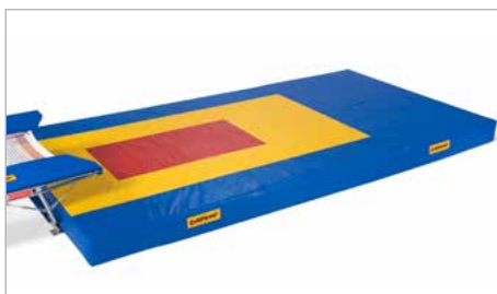
• Art. No. 26101 Landing mat cover