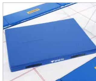
• Art. No. 28500 Spieth spotting mat „Secura“